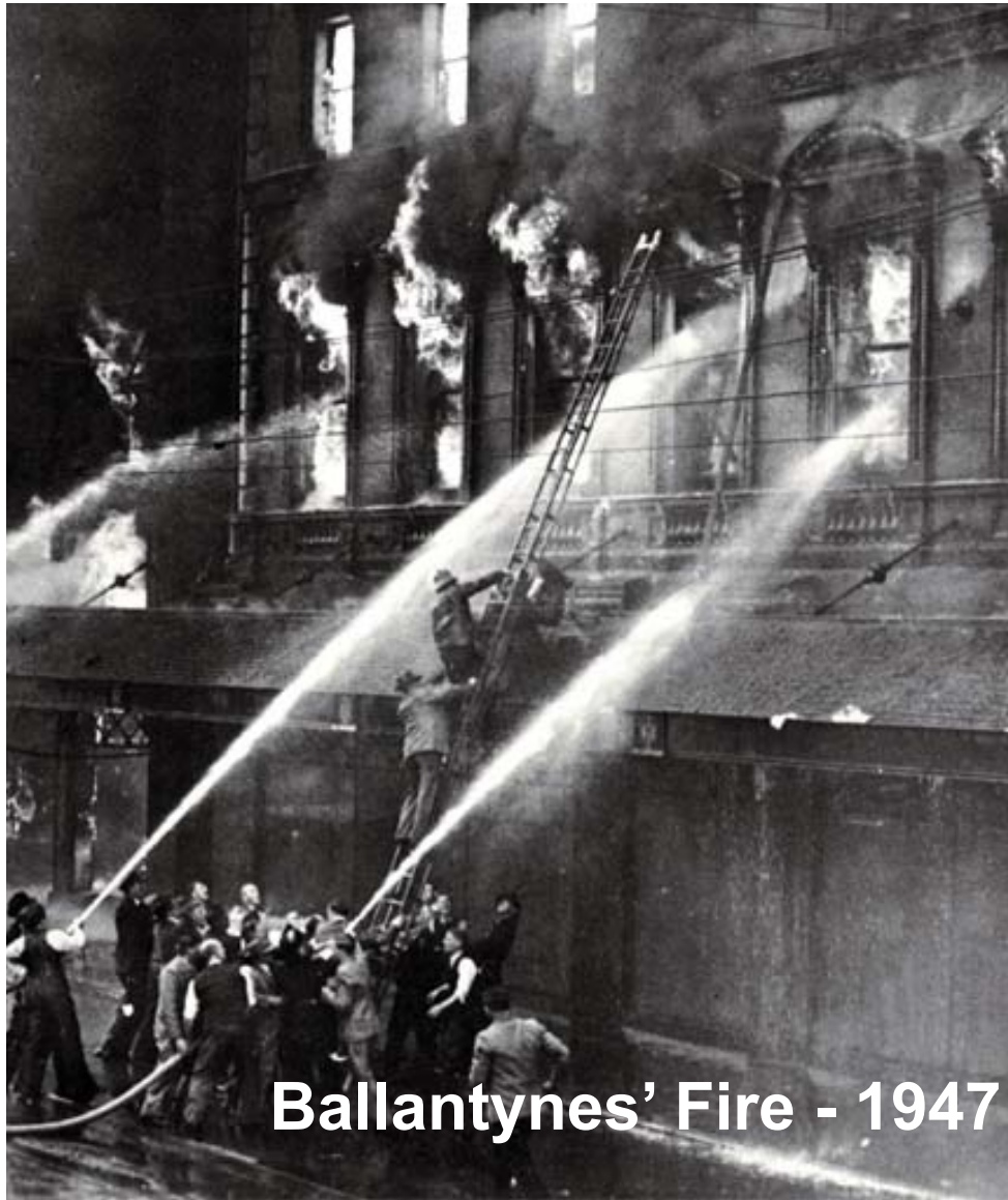
Ballantynes' Fire - 1947