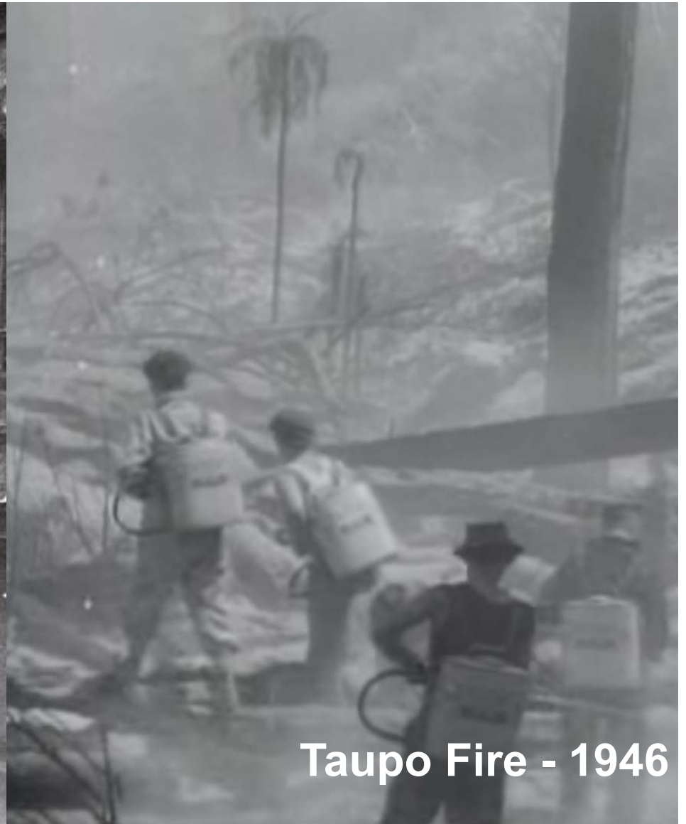
Taupo Fire - 1946